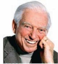
Sidney Sheldon Award Winning Author EVENT CHAIR