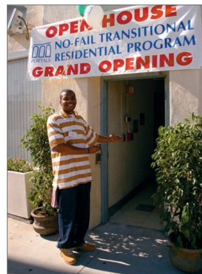
A Portals member welcomes guests as they arrive at the Open House for the No-Fail Transitional Residential Program.