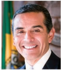
The Honorable Antonio R. Villaraigosa Mayor, City of Los Angeles HONORARY CHAIRMAN

Inquiries: 310.659.5517 • PORTALS@EventsbyOne.com